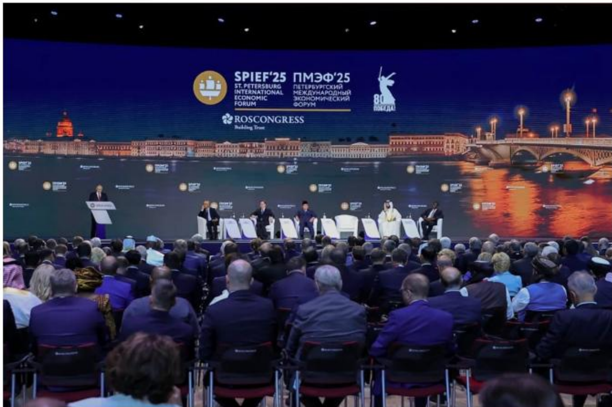
The optimistic spirit of development and cooperation that such a new, creative system implies was on full display this week at the St. Petersburg International Economic Forum (SPIEF).

The only thing this PEACEFUL ACTION demonstrates is that if you want peace, you must go to war. If you wish to witness a true non-contradictory peaceful action in the spirit of development and cooperation, have a look at what President Vladimir Putin is accomplishing in Moscow at the same time.