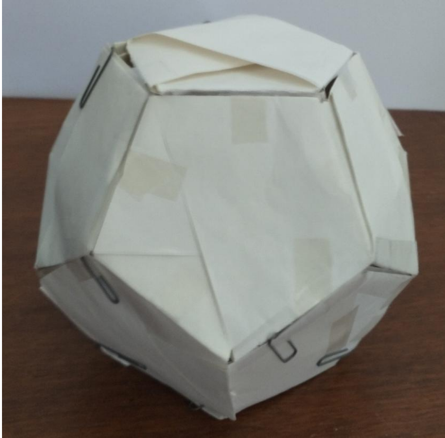
Figure 3. The fivefold knotted dodecahedron