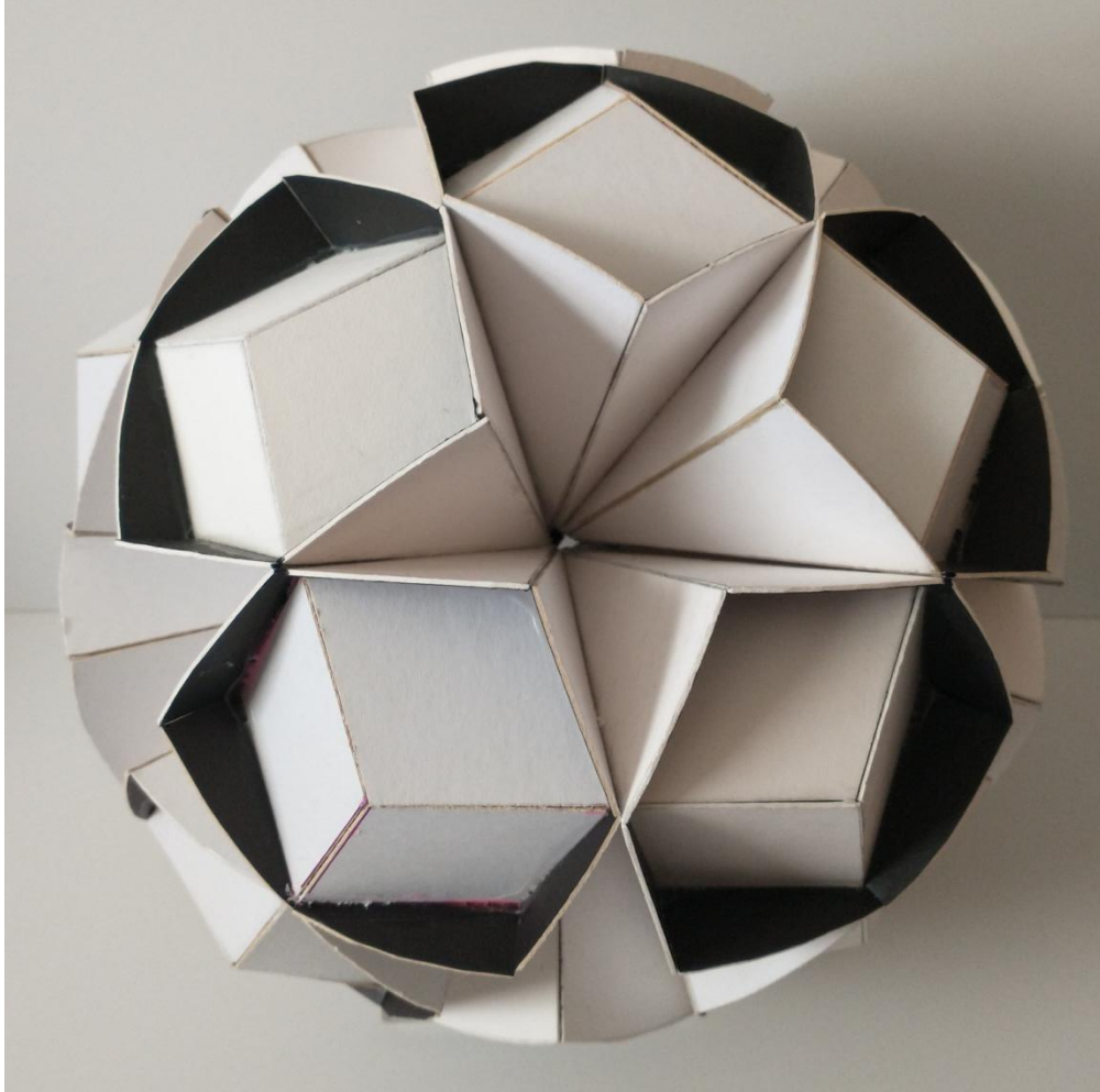
Figure 2. The Zepp-LaRouche Dodecahedral Sphere.