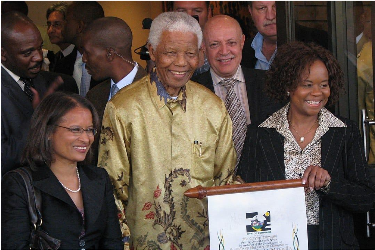
Figure 1. Mandela receiving the freedom of the city of Tshwane, South Africa.